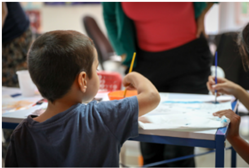
Children paint at a center for refugees in Belgrade, Serbia.

We pray for our brothers and sisters in sub-Saharan Africa – Mali, Somalia, Sudan and Eritrea; we grieve the nearly 16 years of conflict in the Democratic Republic of Congo – the unrest, the millions displaced; we mourn the murders, disappearances, mass rape and torture; we mourn the millions of refugees forced to live in overcrowded camps and urban slums with no opportunities for work or recreation.