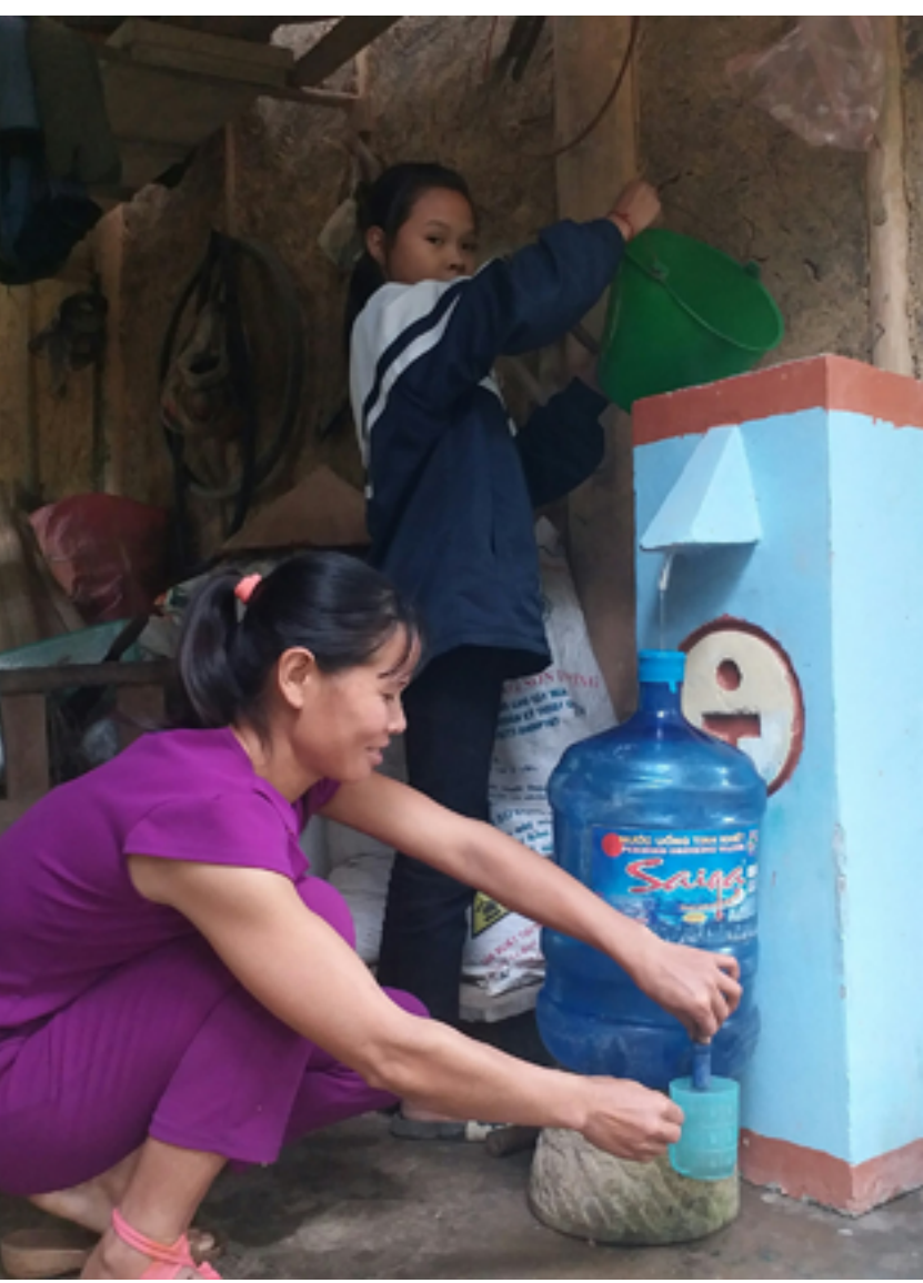
This family in Vietnam uses a biosand filter to purify water for drinking.