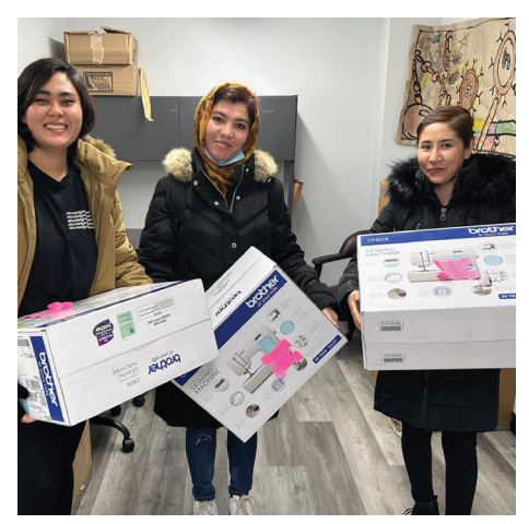
$170 - PROVIDE SUPPLIES FOR A WOMEN'S SEWING CLASS FOR NEW NEIGHBORS IN THE UNITED STATES