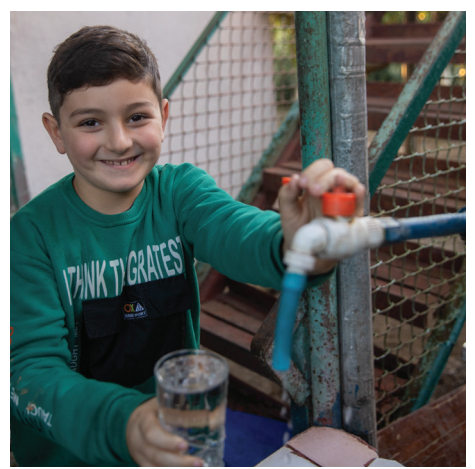
$300 - RAINWATER HAR-VESTING SYSTEM FOR A HOUSEHOLD IN GEORGIA