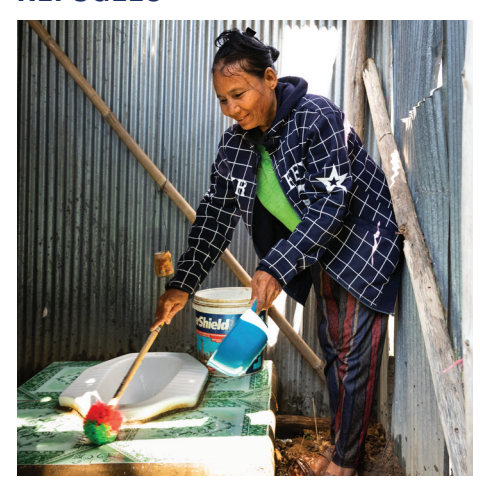
$100 - HOUSEHOLD LATRINE IN CAMBODIA