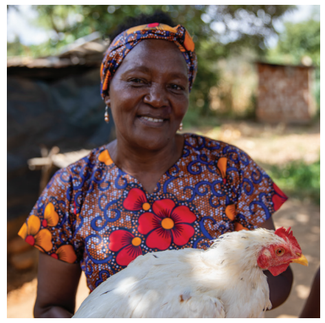
$22 - FIVE CHICKENS FOR A FAMILY IN KENYA