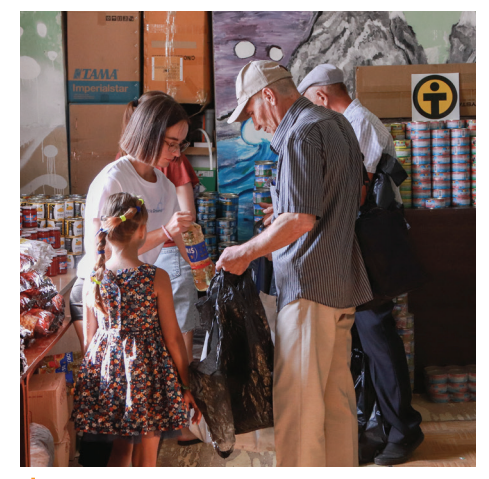
$10 - TWO-WEEK FOOD PACKET (PER PERSON) IN MOLDOVA FOR UKRAINIAN REFUGEES

By fundraising for the CROP Hunger Walk, you're planting seeds of hope and providing Chickens, Beans and Big Dreams for families near and far!